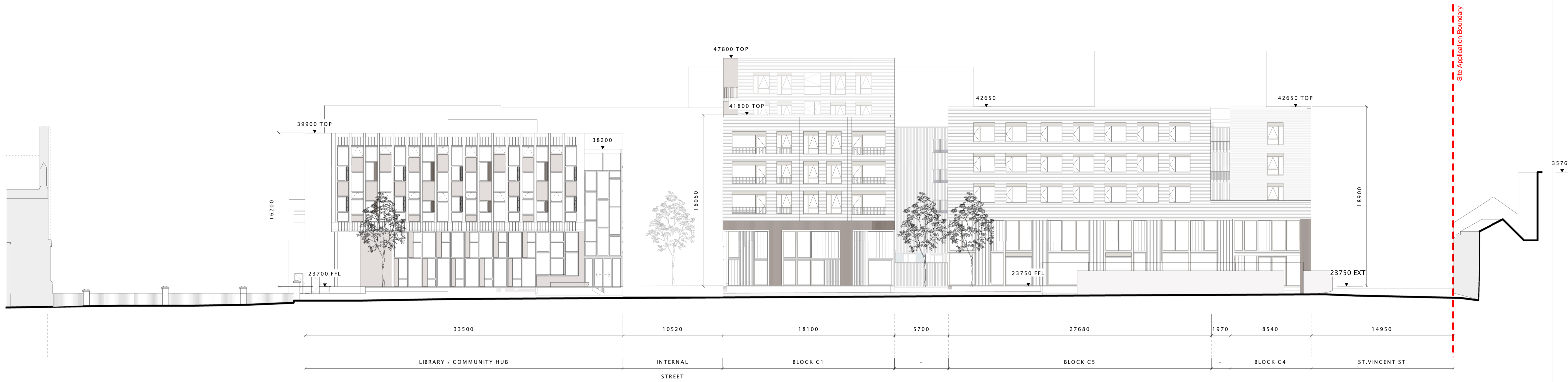
1 CONTEXTUAL ELEVATION - N (EMMET ROAD) 1 : 200